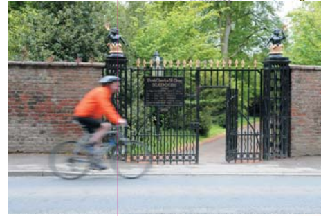
Passing St Mary's, Sledmere