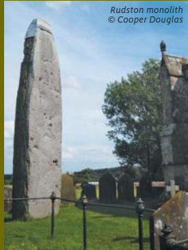
Rudston monolith

Admire the chalk cliff coastline as you cycle via Sewerby Hall and gardens to Bempton Cliffs. Lock your bike to the racks at the RSPB nature reserve visitor centre and walk to the dramatic cliff tops. Thousands of breeding seabirds nest here each summer. Then it's inland to Rudston village with the largest free standing Neolithic stone in Britain, returning along Woldgate Roman Road and through Bridlington's Old Town. Bridlington is on the Yorkshire Coast railway line.