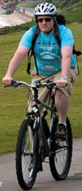
Leaving Bridlington © Jonathan Tait

Map © Crown Copyright 2010. All rights reserved. Licence 0100031673