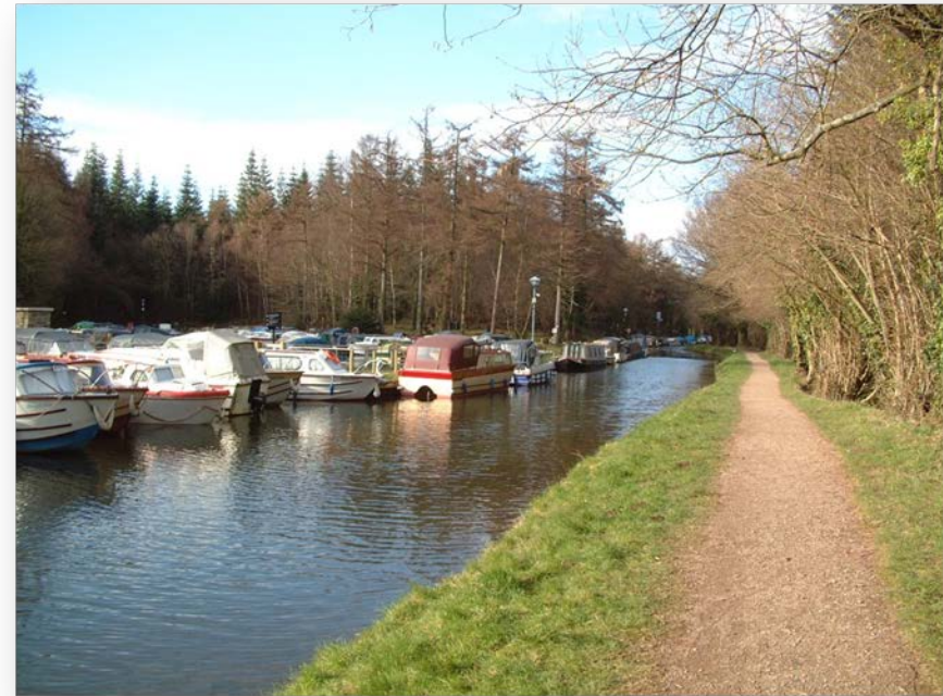
The Monmouthshire & Brecon Canal at Goytre Wharf

No of Stiles: None Some woodland and field paths, towpath and quiet lanes. Mostly level, but with some slopes in the forest.