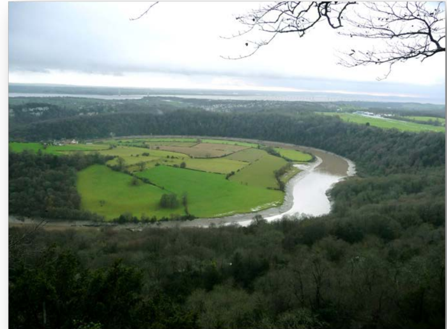
The River Wye and the Severn beyond

Some very steep sections. Over 1100ft of ascent