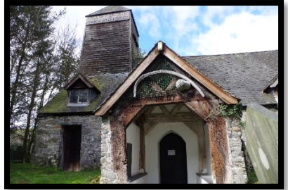
History seems to seep out of every turn of the paths in the Dyfi valley. But what is this on the Mallwyd Church porch? Find out on the tour!