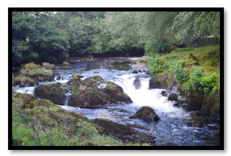
The sun in summer or winter makes the Dyfi valley inviting and invigorating.