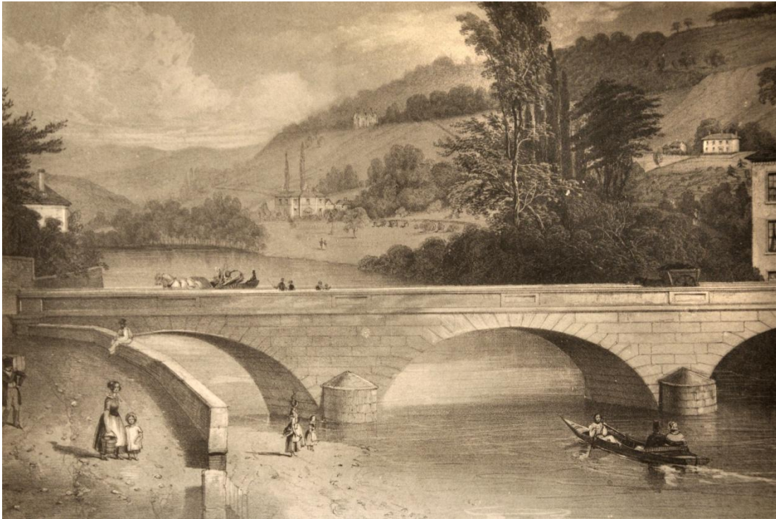
The long bridge over the Severn