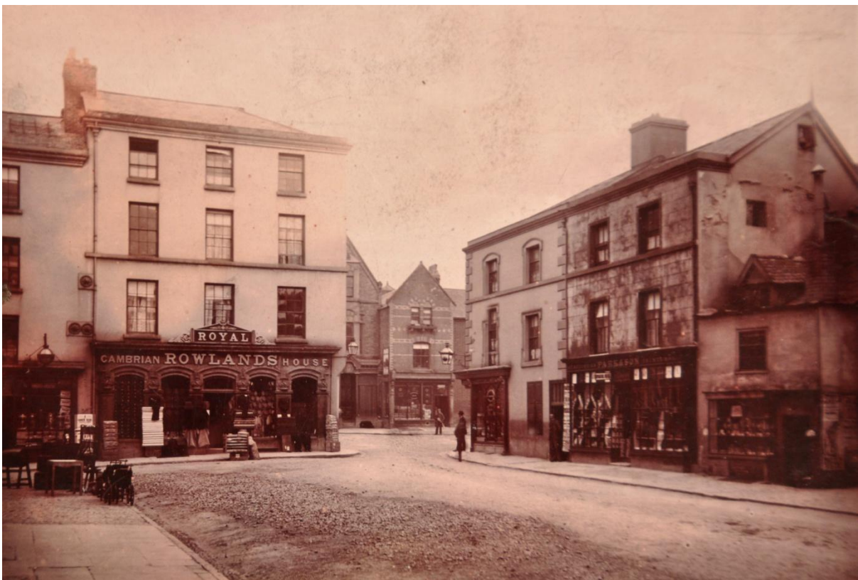
Owen's Birthplace at The Cross in Newtown