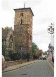
Holy Trinity church