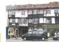
Red Lion Hotel