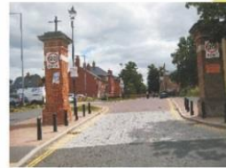
Entrance to Butt Rd car park