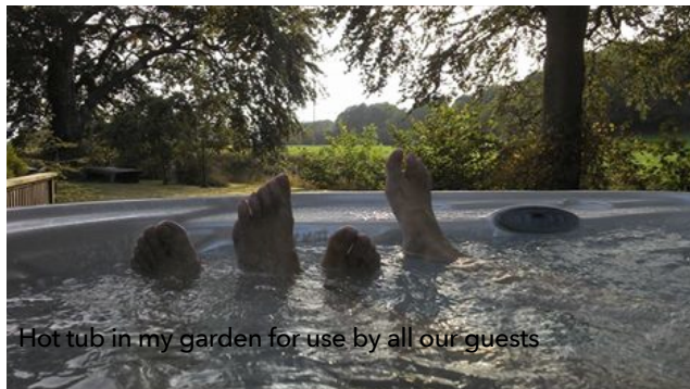
Hot tub in my garden for use by all our guests

Cysgod Bach or Caban y Saer (our self catering for 2) are great for your activity break here in Bala in the Snowdonia National Park. Ideal for touring, walking, cycling and all those outdoor activities to be found locally.