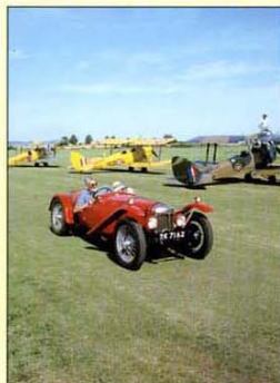
The Shuttleworth Collection, Old Warden