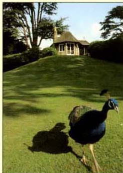
The Swiss Garden, Old Warden

END OF STAGE 2 - PLEASE NOW GO TO STAGE 3