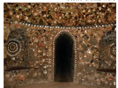
Scott's Grotto, Ware