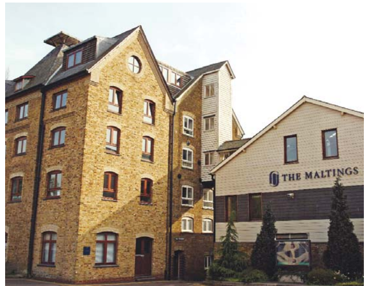
The Maltings, Stanstead Abbots

16 Turn R onto the towpath (National Cycle Network Route 61) beside the River Lea, SP 'Ware 2 1/4'.