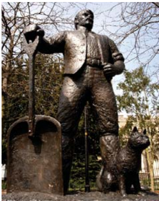
The Maltmaker, Ware

D Much Hadham - long High Street with well-preserved timber/brick houses. Former country seat of the Bishops of London. Edmund Tudor, father of Henry VII was born here in 1430. 🗺️