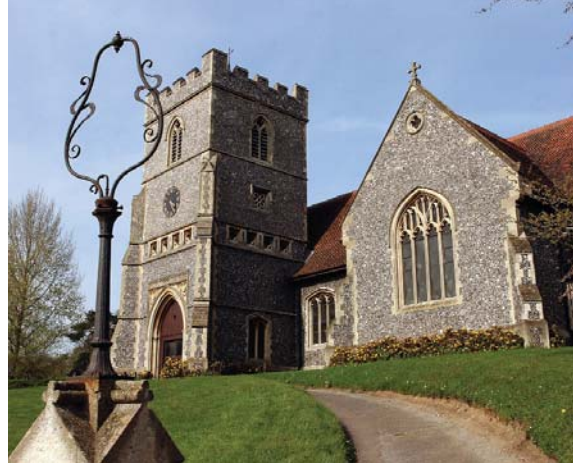
St. James Church, Stanstead Abbots

F Hunsdon - timber and weather-boarded cottages overlook the green with its pump. To the east is the site of the former Second World War RAF airfield (a Mosquito bomber is shown on the village sign). 🗺️