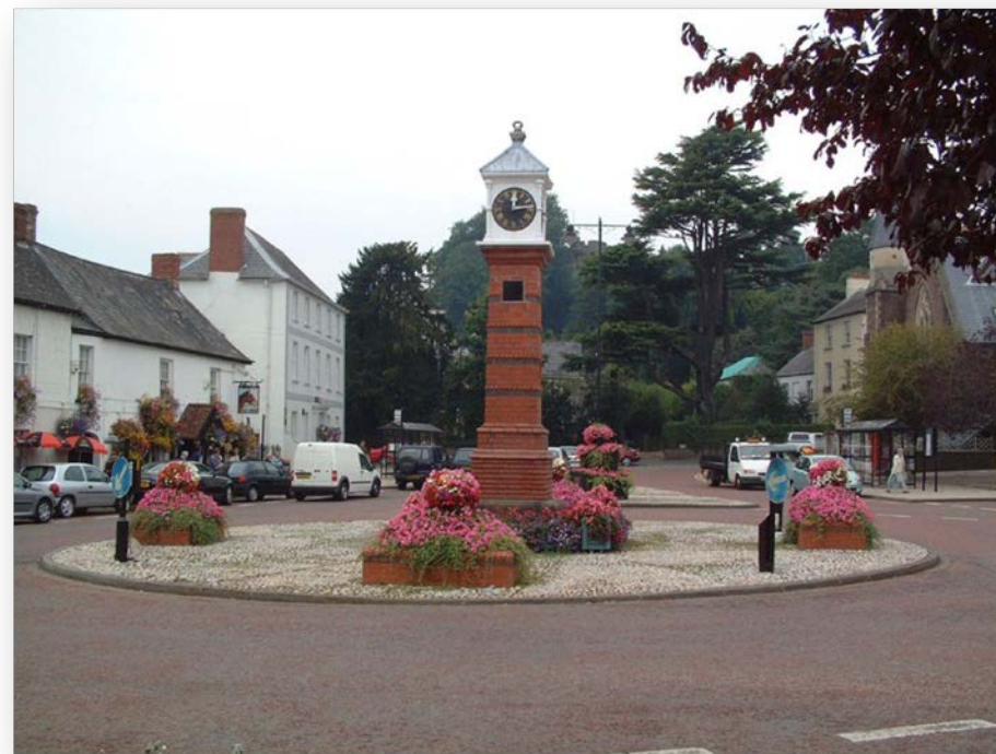
Twyn Square, Usk

Steady ascent to highest point in Lady Hill Wood.